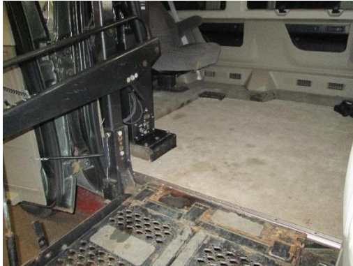
Full-size van with lowered floor

The lowered floor can differ slightly based on the type of ramp used. The purpose of a lowered floor is two-fold. It allows for more headroom for the wheelchair occupant and, when combined with a kneeling system, it provides for a more manageable incline to enter and exit the vehicle. A kneeling system is a predominant feature on a minivan.