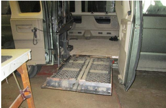
This full-size van has a side entry wheelchair lift.

Is the ramp located in the side or rear of the vehicle? Is it power or manual?