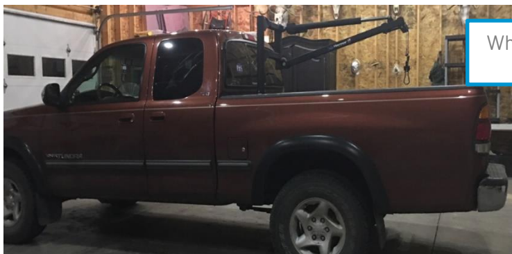
Wheelchair Carrier in Pick Up truck bed